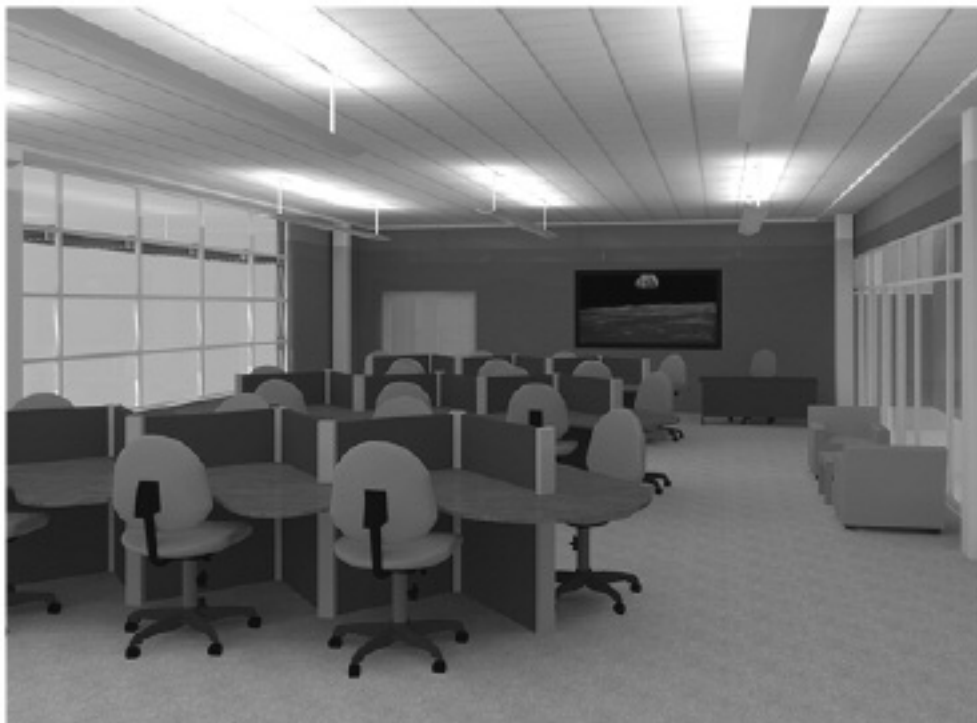
This possible design shows how the new computer room could be configured. It will face Liberty Avenue and will include more than 20 Internet-access computers.

Computer-generated pictures show design concepts