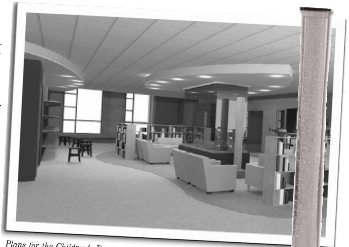
Plans for the Children's Department include a fish tank and "bubble tubes" that could look like the ones shown in the design above.

s will be added. They will serve groups of urrently used as a computer lab will be con-