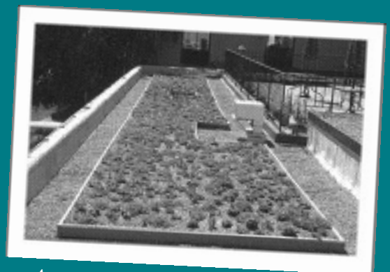
An example of a green roof system.

The roof will serve as a model of sustainable design for the community and it will also be available as an educational tool. The layers of a green roof include the vegetative matter, a growing medium, a drainage layer, an insulating medium, and structural support.