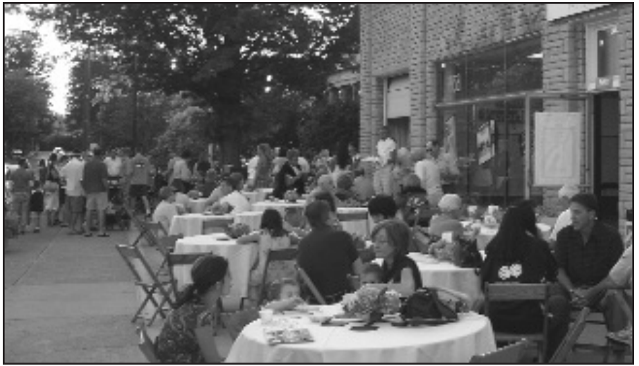
Hundreds of residents gathered for one last blast in the annex last month, to celebrate Ritter's 50th anniversary on Liberty Avenue.

5680 Liberty Ave. 440-967-3798 Vermilion, OH 44089 Fax: 440-967-5482 Dial-A-Story: 440-967-3799