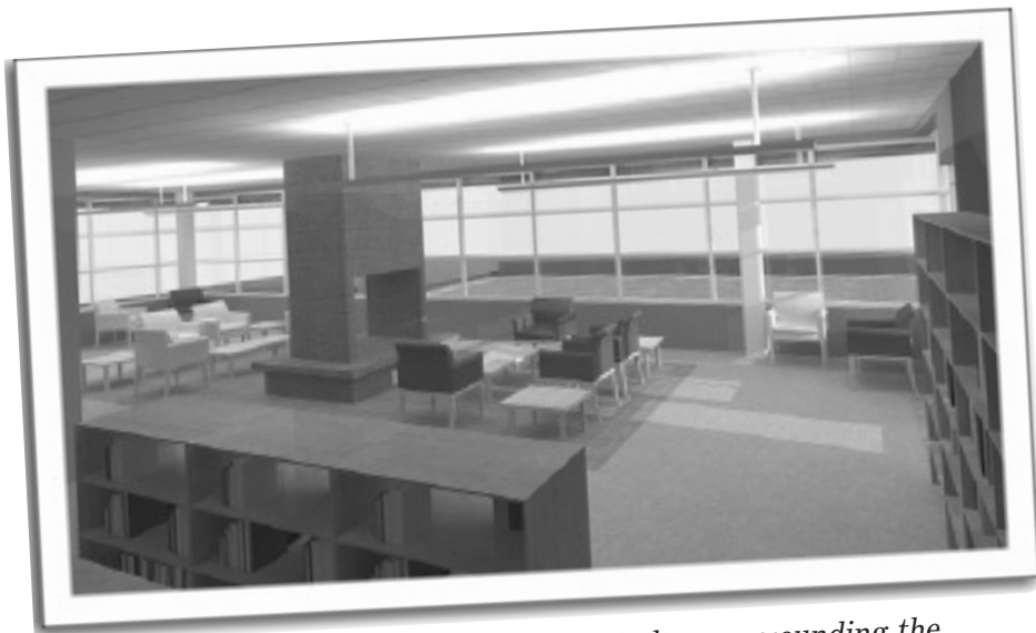
This computer-generated design shows windows surrounding the upstairs reading room for adults, which will look out over a green roof. The centerpiece will be a cozy fireplace.